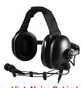
High Noise Behind the Head Headset HS75NR-X03S