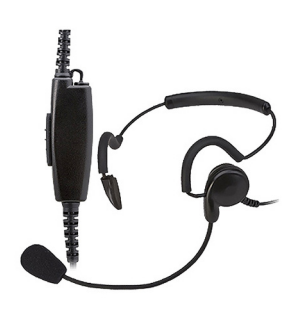
Light Duty Behind the Head Headset HS12-X03S