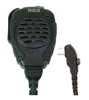
Heavy Duty Speaker Mic SM310-X03S