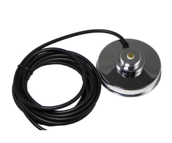
Universal Mobile Antenna Mount G8PI