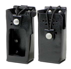
Leather Holsters For RDR4330 / RDR4360 / RDR4390