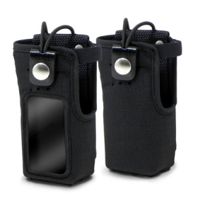
Nylon Holsters For RDR4330 / RDR4360 / RDR4390