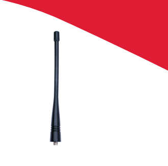
Whip Antenna ANH4300-W VHF/UHF