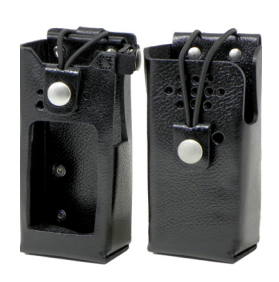
Leather Holsters For RDR4320 / RDR4350 / RDR4380