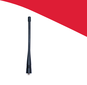
Whip Antenna ANH4300-W VHF/UHF