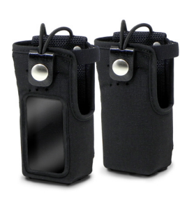
Nylon Holsters For RDR4330 / RDR4360 / RDR4390