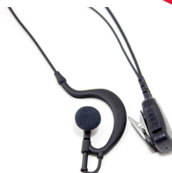
One-Wire Surveillance Kit Ear Hook Style SK11EH-X83