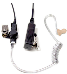
Two-Wire Surveillance Kit In-Ear Style SK21NE-X83