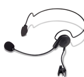
Light Duty Behind the Head Headset HS12-X83