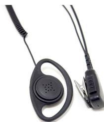
One-Wire Surveillance Kit D-Loop Style SK11DL-X83