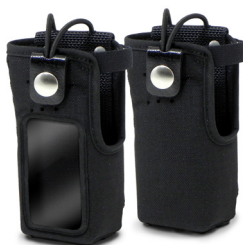
Nylon Holsters For RDR3500 & RDR3600