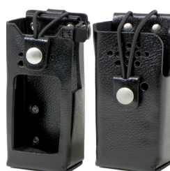
Leather Holsters For RDR3500 & RDR3600