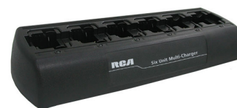
6 Bank Charger CHU6 w/ RDR3500, RDR3600 cup