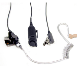
Three-Wire Surveillance Kit In-Ear Style SK31NE-X83