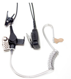
One-Wire Surveillance Kit In-Ear Style SK11NE-X83