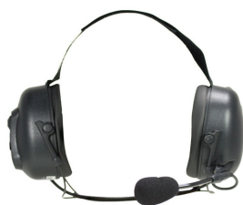
Heavy Duty Behind the Head Headset HS61NR-X83, HS62NR-X83, HS72NR-X83