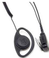
One-Wire Surveillance Kit D-Loop Style SK11DL-X83