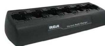
6 Bank Charger CH06