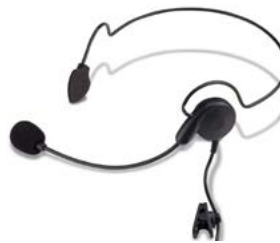
Light Duty Behind the Head Headset HS11V-X83