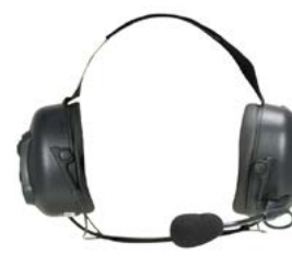
Heavy Duty Behind the Head Headset HS61NR-X83, HS62NR-X83, HS72NR-X83