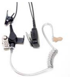
One-Wire Surveillance Kit In-Ear Style SK11NE-X83