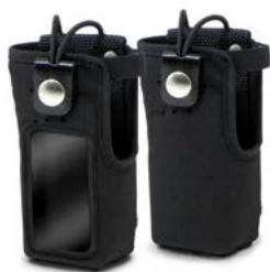
Nylon Holsters For RDR3500 & RDR3600