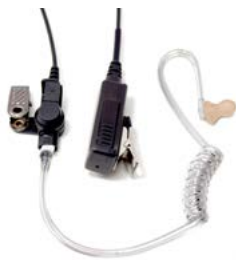
Two-Wire Surveillance Kit In-Ear Style SK21NE-X83