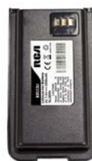
Battery Upgrade B3523LI Lithium-Ion 7.4V 2300mAh 17.02 Wh