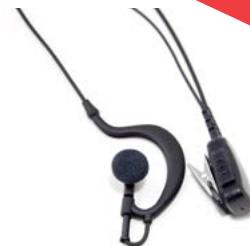
One-Wire Surveillance Kit Ear Hook Style SK11EH-X83