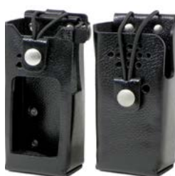
Leather Holsters For RDR3500 & RDR3600